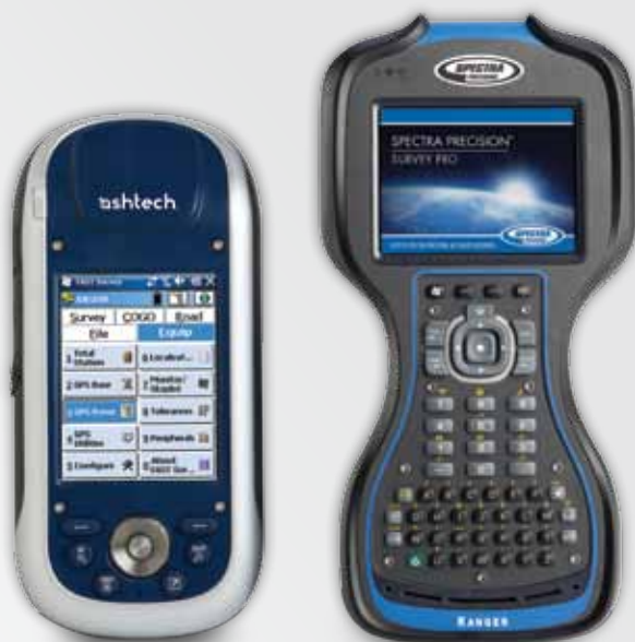
Ashtech ProMark 100

Spectra Precision Survey Pro field software provides you with a complete set of capabilities for all your survey projects. It's fast, reliable and easy to use. It provides unparalleled integration, data integrity, and efficiency. Survey Pro software is offered in a variety of modules to best fit the job, and features can be added as needed.